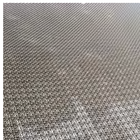
Mould patches on woven S.S. mesh