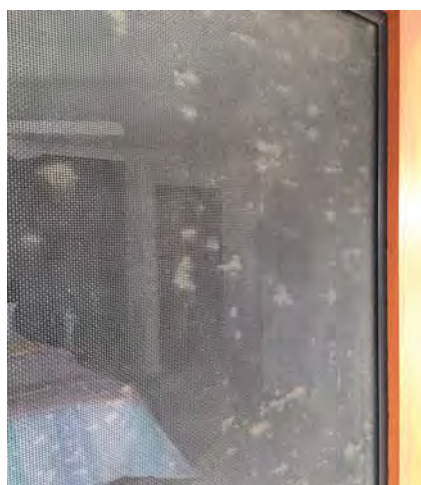
Dirt build up on a woven S.S. mesh

All metal mesh screens have a problem with electrostatic action between the mesh and airborne salts. The common solution is to regularly remove salt build up with high pressure water blasting and to seek to isolate the metal from the salts with a silicon or wax layer. There are many different forms of wax coating available commercially, ranging from Mr. Sheen to automotive wash and wax products. There are also commercially available silicone sprays sold by automotive retailers. All mesh screens trap dust and airborne particles attracted by electrostatic interaction as breeze passes through the mesh. If this impurity builds up and is not regularly removed, it will encrust the screen irreparably. There are also fungal moulds that can grow in patches on mesh caused by airborne spore. Obviously, screens in coastal locations are more vulnerable to salt attack than hinterland locations and maintenance is a bigger issue. Similarly, locations near dense vegetation have greater risk of fungal spots (which are often mistaken for rust spots) and can be eliminated by antimould and a topcoat of silicone spray. Woven screens intrinsically entrap more particles than perforated screens but the problems are the same and regular maintenance is the only prescription for long term durability.